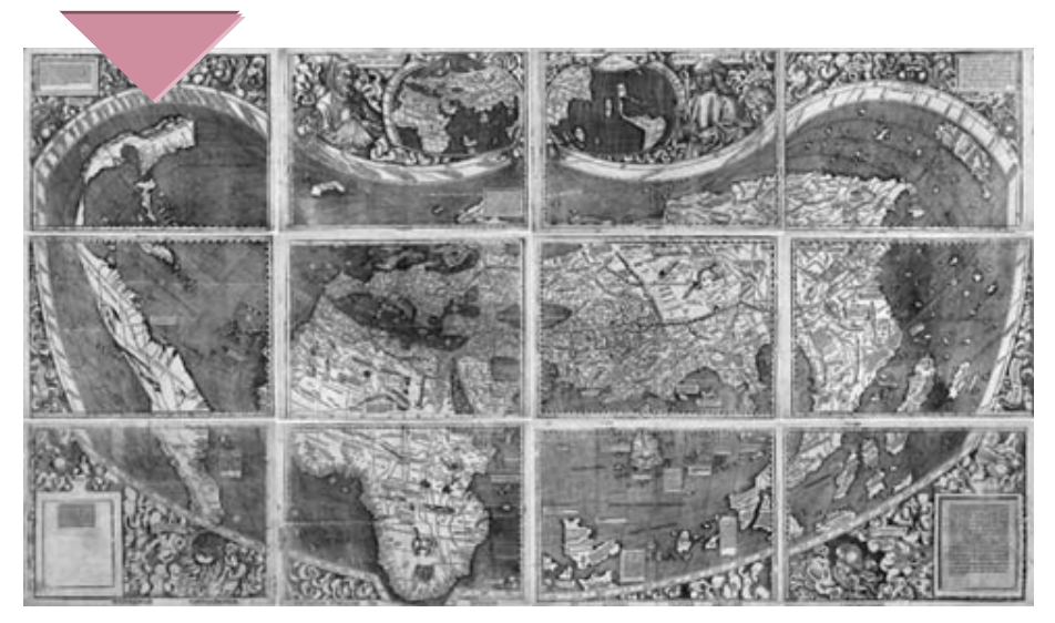
#2275 The Yom Kippur War and the Abomination of Desolation – The post-World War II U.S. waxing great Page 1 of 2 toward the South and toward the East as a second Syria/Antiochus IV Epiphanes, part 534, The Pale Horse, (cxxxi), Narrowing the definition of the "fourth part of the earth" from the Western Hemisphere to the Northwestern Quadrant of the World

The one-half of the world that was the "fourth part" of the world