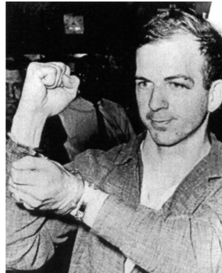
Lee Harvey Oswald, a Pale assassin

Key Understanding #2 (from Key Understanding #1 of Unsealing #1952 ): The Lord’s warning through the Kennedy assassination. This future “head wound” to the 8 th Head Scarlet Beast of Revelation 17 (the United States of America), which is just a part of the overall layered understandings attached to Revelation 13:3, can be further found in prophecy in Daniel 7:11. The November 22, 1963, assassination of John F. Kennedy was a presaging and forewarning event of “I beheld even till the beast was slain” in Daniel 7:11, for Kennedy represented the United States of America as the Little Horn (nation) of Daniel 7:8 and the Beast (out of the Sea) of Revelation 13:1-3 (as was clearly outlined in the Unsealings preceding Unsealing #1952 ).