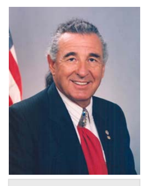
Ben Nighthorse Campbell