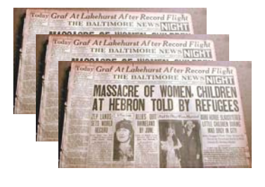
Friday, 17 Av 5689 (August 23, 1929)

Members of the Haganah arrived in Hebron from Jerusalem. They requested to leave weapons in Hebron, in the bank, so as not to be found and confiscated by the British police. [The Jews in Hebron refused the weapons. They responded by saying that they had nothing to worry about. Hebron's Arabs were their friends. They had no need for weapons.]