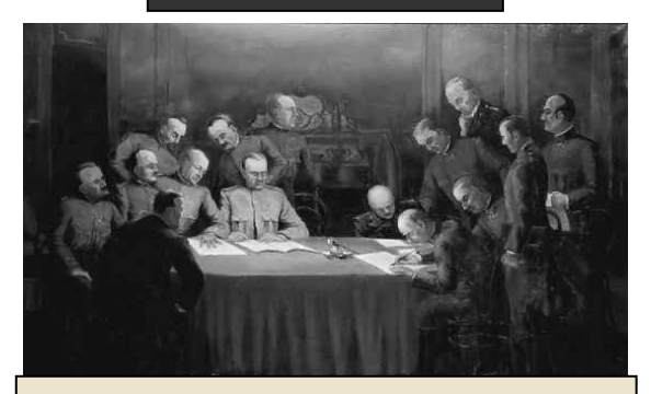
Austrian armistice signed, takes effect

Key Understanding: The surrender of the Austrian Empire on November 3-4, 1918, marked a rising of the 'Austrian Successor' American "prince that shall come" in fulfillment of Daniel 9:26, and the "prince that shall come" is linked with Daniel 9:25, "the street shall be built again, and the wall, even in troublous times."