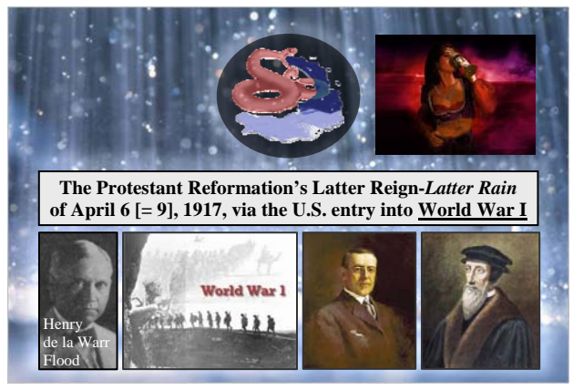
#2377 The Yom Kippur War and the Abomination of Desolation – The post-World War II U.S. waxing great Page 2 of 3 toward the South and toward the East as a second Syria/Antiochus IV Epiphanes, part 636, Building the Christian-Jewish-Arab Temple, (xv), Repeat of Unsealing #1003 to understand the building of the Christian House of God (Temple of God) through Making the World Safe for Democracy