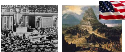
Step 1 – attached to World War I

Key Understanding: Building the 'Third Temple' of the Jews. However, the main thrust of the subject matter is that the United States, as the true second Babylon, or Babylon the Great, but also simultaneously in the role as a second but counterfeit Media-Persia, (i) delivered the Promised Land (with the significant involvement of Great Britain) out of the hands of the Ottoman Empire in World War I, and (ii) delivered the Jews (finally) from the Holocaust and Nazi Germany in World War II, into the Promised Land.