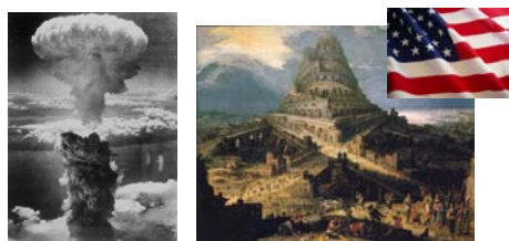
Step 2 – attached to World War II