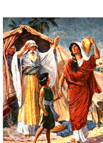
Abraham casting out Hagar and Ishmael

Main Page and List of Unsealing Summaries