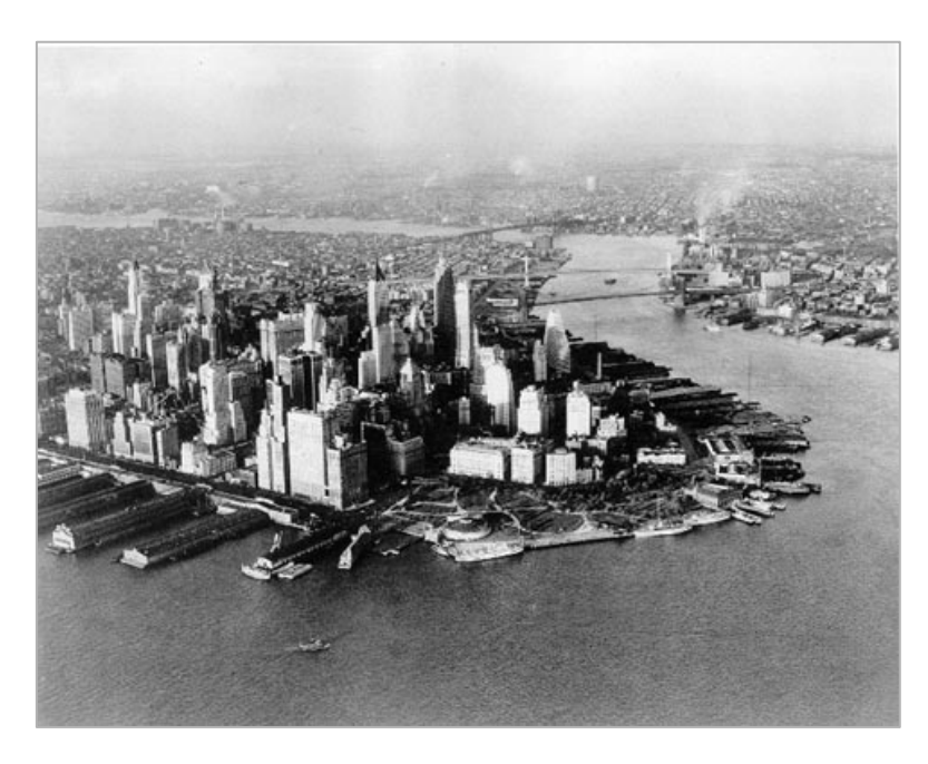
#2434 The Yom Kippur War and the Abomination of Desolation – The post-World War II U.S. waxing great Page 2 of 3 toward the South and toward the East as a second Syria/Antiochus IV Epiphanes, part 693, Building the Christian-Jewish-Arab Temple, (lxxii), The beginnings of Wall Street and the Netherlands and England pits: At the time that New Amsterdam was becoming New York City, which would become the leading financial center of the world, Old Amsterdam was the financial center of the world