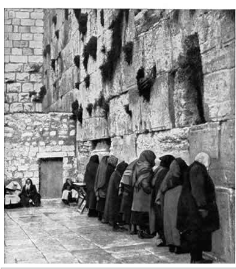
The Wailing Wall, Jerusalem, circa 1927

Key Understanding #2: The destruction of the Jewish Temple, and the attempted destruction of Jesus Christ. Of course, the destruction of the Temple in 70 A.D., prophesied by Jesus Christ (Matthew 24:2), is prophetically entwined with the destruction of the temple of Jesus Christ, speaking of his body.