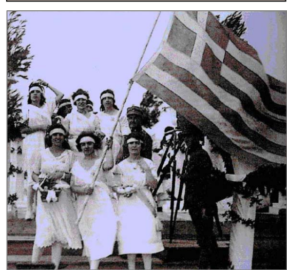
Greek girls celebrate the liberation of Smyrna from the Ottoman yoke