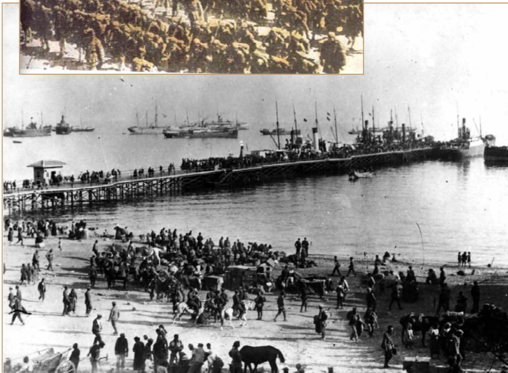
Landing of Greek soldiers in the harbor of Smyrna, 1920