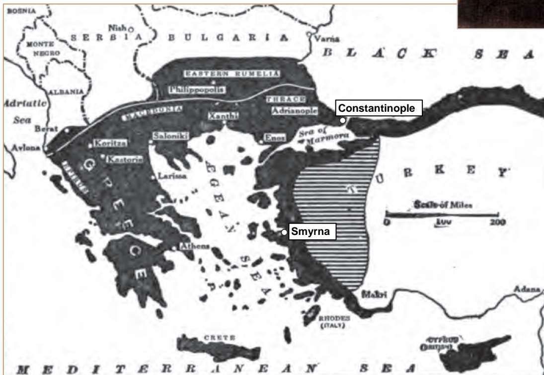
The territories claimed by Greek Prime Minister Venizelos at the Paris Peace Conference in 1919 included the cities of Smyrna and Constantinople.

Here is #2491–Doc 1 , the first part of the Wikipedia article on the Greco-Turkish War of 1919-1922 . The article is somewhat lengthy, but necessary and excellent, summarizing the background of the May 15, 1919, occupation of Smyrna by the Greeks.