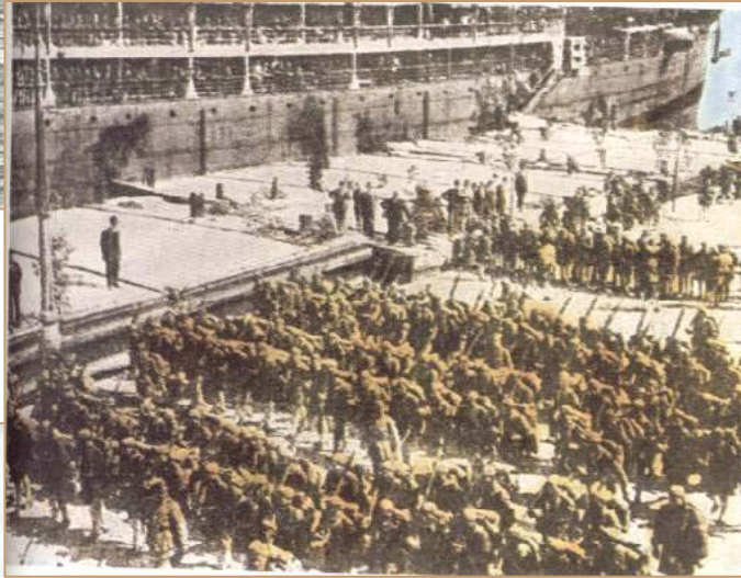
Landing of a Greek regiment at Smyrna in 1919