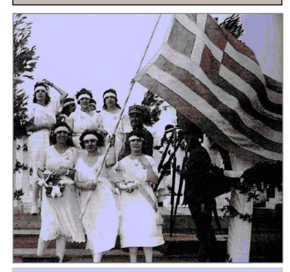
Greek girls celebrate the liberation of Smyrna from the Ottoman yoke

The end of the Ottoman Empire eventually led to the May 15, 1948 Birth of Israel