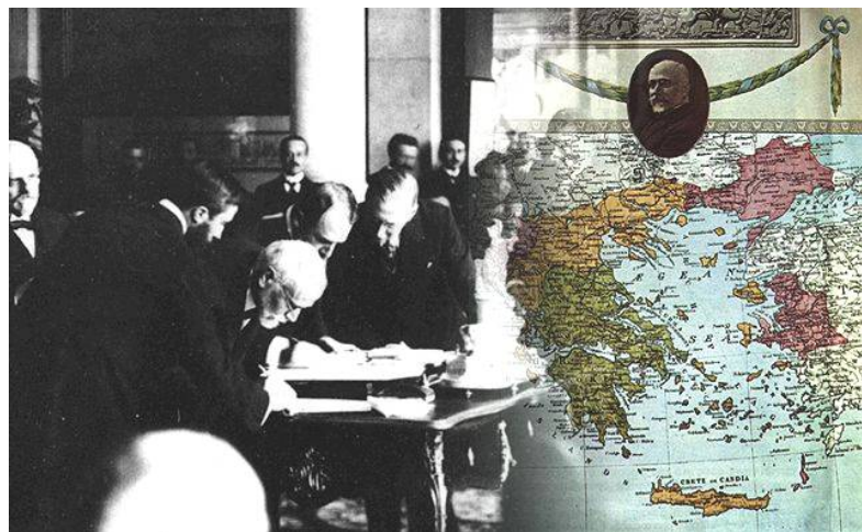
Venizelos signing the Treaty of Sèvres on August 10, 1920

in western Thrace and Macedonia to Greece. The Treaty of Sèvres, signed with Turkey on August 10, 1920, gave Greece the Aegean Islands, hence command of the Dardanelles, and the