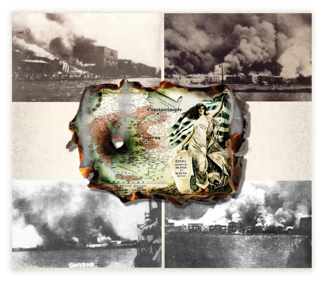
#2500 The Yom Kippur War and the Abomination of Desolation – The post-World War II U.S. waxing great Page 1 of 3 toward the South and toward the East as a second Syria/Antiochus IV Epiphanes, part 759, Smyrna Jews, (xviii), Smyrna and the Great Idea go up in flames because the Greeks were not representative of the Revelation 2:8-11 true church in Smyrna

Half of Smyrna went up in smoke on September 13-17, 1922, along with the Great Idea. Thousands of civilians died in the conflagration; others drowned while attempting to escape by swimming out to Allied warships in the harbor.