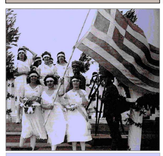
Greek girls celebrate the liberation of Smyrna from the Ottoman yoke