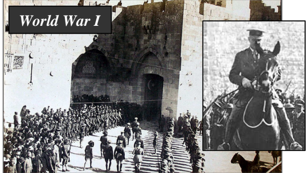
World War I – Ishmael's Seed The "freeing" of Jerusalem for a Jewish national home (and an Arab national home) represented the Jews (and Arabs) spiritually as Ishmael's Seed (as the Jews were in John 8:31-40)