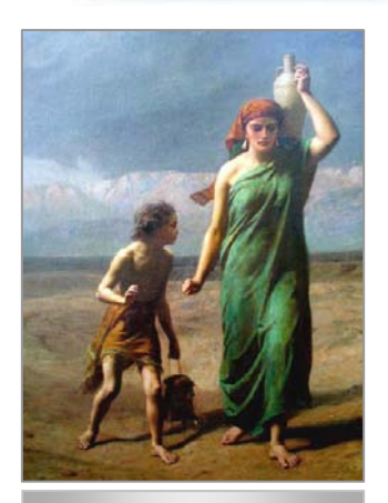
Ishmael and Hagar

(ii) The Genesis 16 and (specifically the) Genesis 16:16 Birth of Ishmael