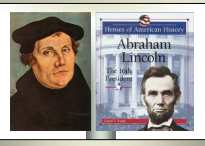
Abraham's Battle of Gettysburg