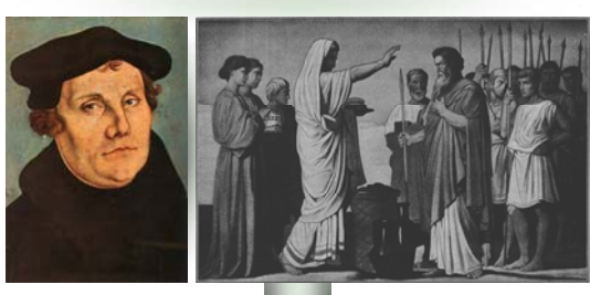
Abraham's Battle of Dan