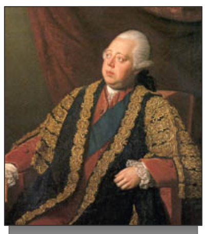
Lord Frederick North, Prime Minister of Great Britain during the Revolutionary War

Daniel 7:8 (KJV) I considered the [ten] horns, and, behold, there came up among them another LITTLE HORN [rising against Lord North], before whom there were THREE OF THE FIRST HORNS plucked up by the roots: and, behold, in this horn were eyes like the eyes of man, and <u>A MOUTH</u> SPEAKING GREAT THINGS [referring to the