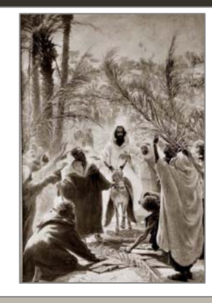
John 12:12-13 (KJV) On the next day <u>much people</u> that were come to the feast, when they heard that Jesus was coming to Jerusalem, 13 <u>TOOK BRANCHES OF</u> <u>PALM TREES</u>, and went forth to meet him, and cried, Hosanna: Blessed is the King of Israel that cometh in the name of the Lord.

Palm branches and <u>Palm Sunday</u> and the deliverance of the Jews from the bondage of the <u>Romans</u> by Jesus Christ