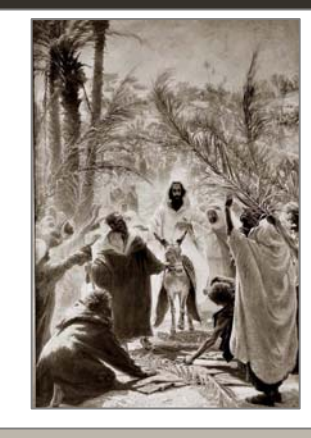
John 12:12-13 (KJV) On the next day <u>much people</u> that were come to the feast, when they heard that Jesus was coming to Jerusalem, 13 <u>TOOK BRANCHES OF</u> <u>PALM TREES</u>, and went forth to meet him, and cried, Hosanna: Blessed is the King of Israel that cometh in the name of the Lord.

Palm branches and <u>Palm Sunday</u> and the deliverance of the Jews from the bondage of the <u>Romans</u> by Jesus Christ