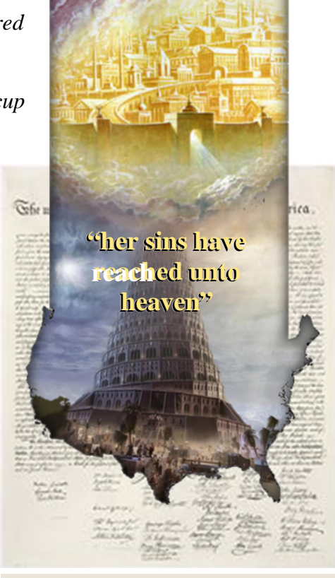
Declaration of Independence July 4, 1776

Key Understanding #2: Babylon's sins have reached unto heaven. The U.S. Declaration of Independence